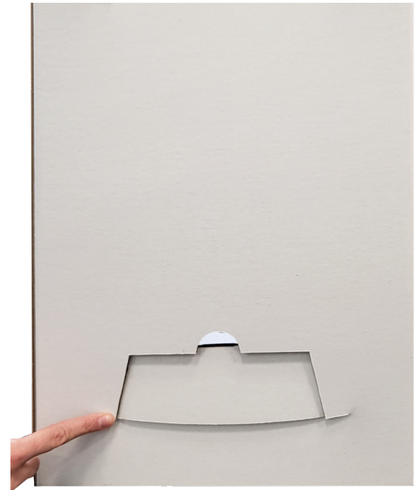
BACK OF DISPLAY

7 INSERT BACK TAB ON SHELF INTO BACK SLOT OF THE FLOOR DISPLAY.