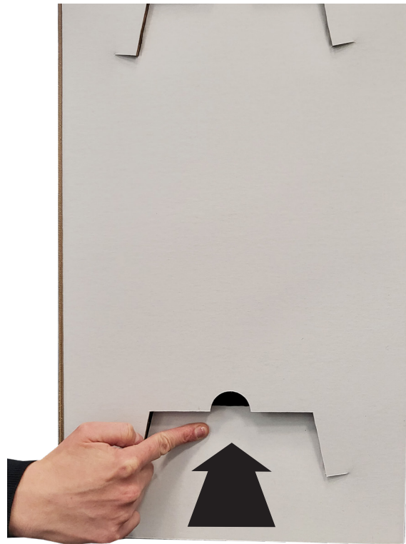
BACK OF DISPLAY

7 INSERT BACK TAB ON SHELF INTO BACK SLOT OF THE FLOOR DISPLAY.