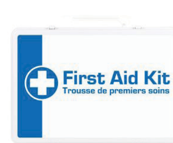
Type 2 Basic PLASTIC BOX