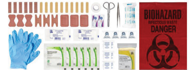
Type 1 Personal NYLON POUCH REFILL 5354.000177