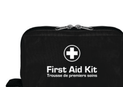
Type 1 Personal NYLON POUCH