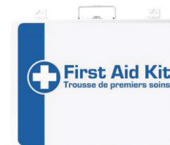
Type 3 Intermediate METAL CABINET