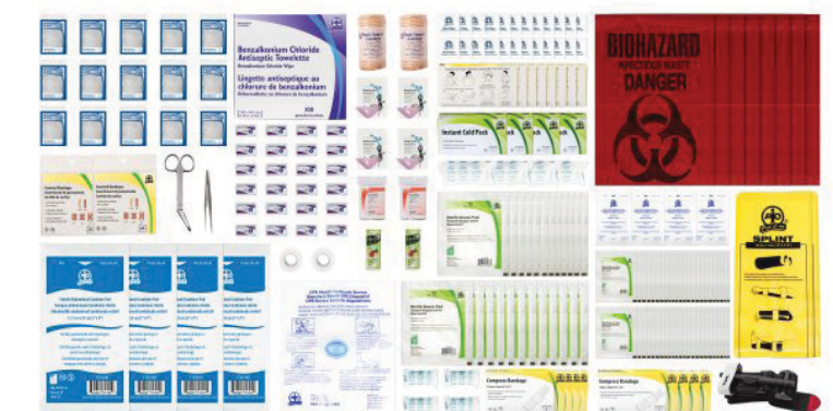
Type 3 Intermediate METAL CABINET REFILL 5354.000181, 5354.000182, 5354.000183